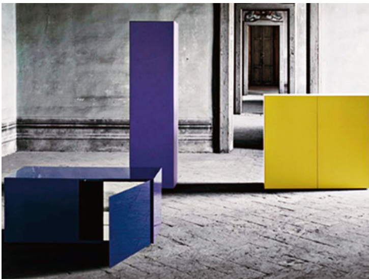
84 BLUE 83 PURPLE 49 YELLOW